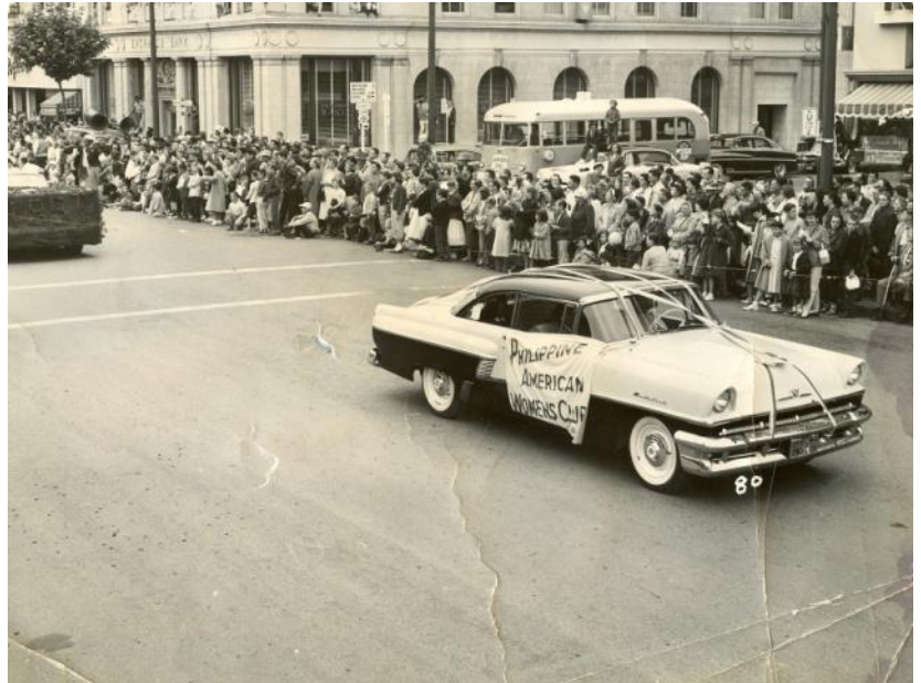
The Philippine American Women's Club car participating in the Rose Parade, circa 1952.